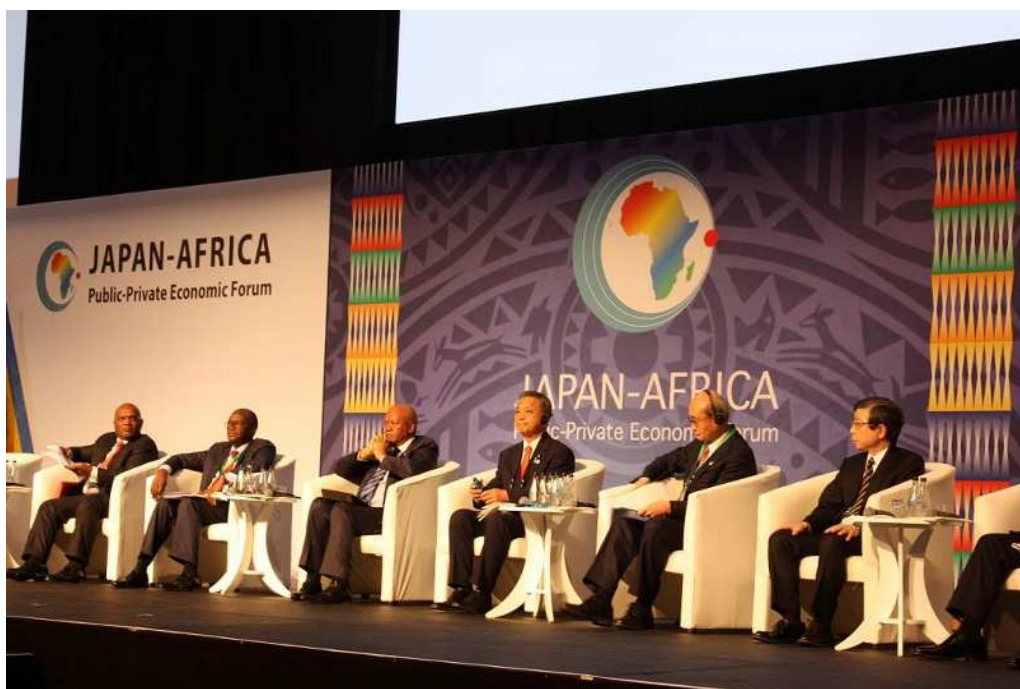
Plenary Session II “Energy and Infrastructure Enhancement in Africa”

Promoting infrastructure development in Africa while valuing partnerships with local people is the most important element in improving the quality of infrastructure, and this is the core concept of Japanese-style “Quality Infrastructure.” The Government of Japan, including the Ministry of Land, Infrastructure, Transport and Tourism, will further promote strategic efforts in cooperation with the public and private sectors toward TICAD7, which is scheduled to be held in Yokohama next year.”