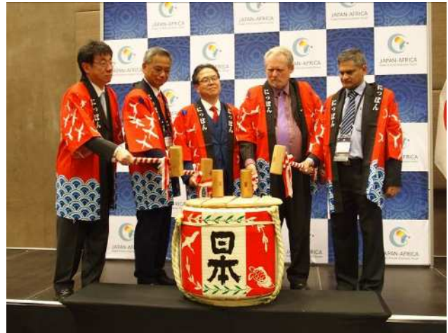
Plenary Session (Reception)