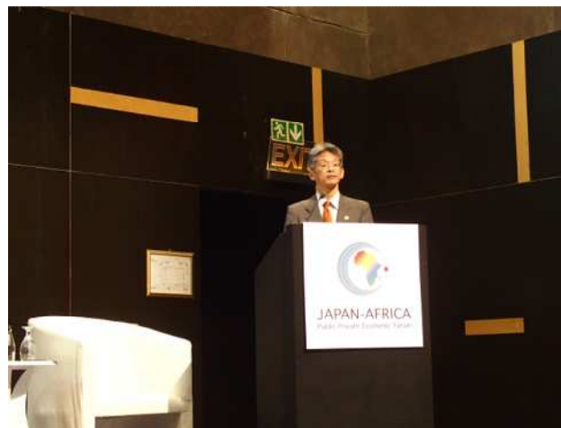
Keynote Speech (Deputy Minister for Construction, Engineering and Real Estate Industry Aoki)

In the keynote speech, Deputy Minister for Construction, Engineering and Real Estate Industry Aoki made a presentation on “Cooperation for High Quality Infrastructure Development in Africa and Japan.”