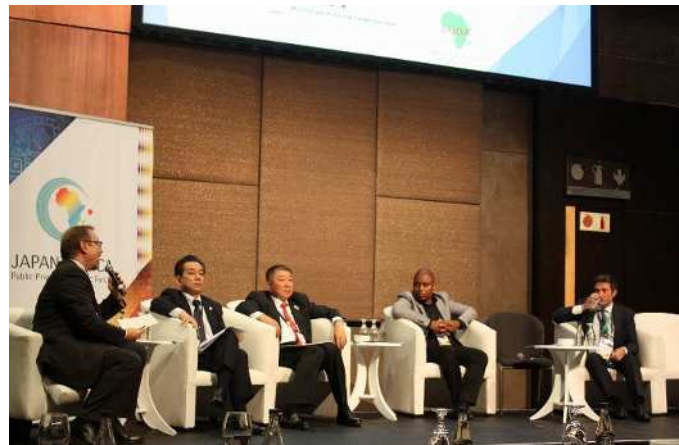
“Private Sector Dialogue”