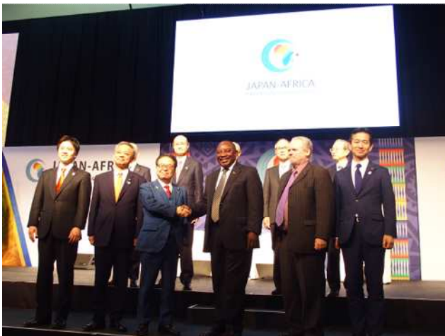
Plenary Session (Keynote Speech)

President of South Africa Ramaphosa, 42 African countries including 28 Ministers, approximately 500 African companies and others