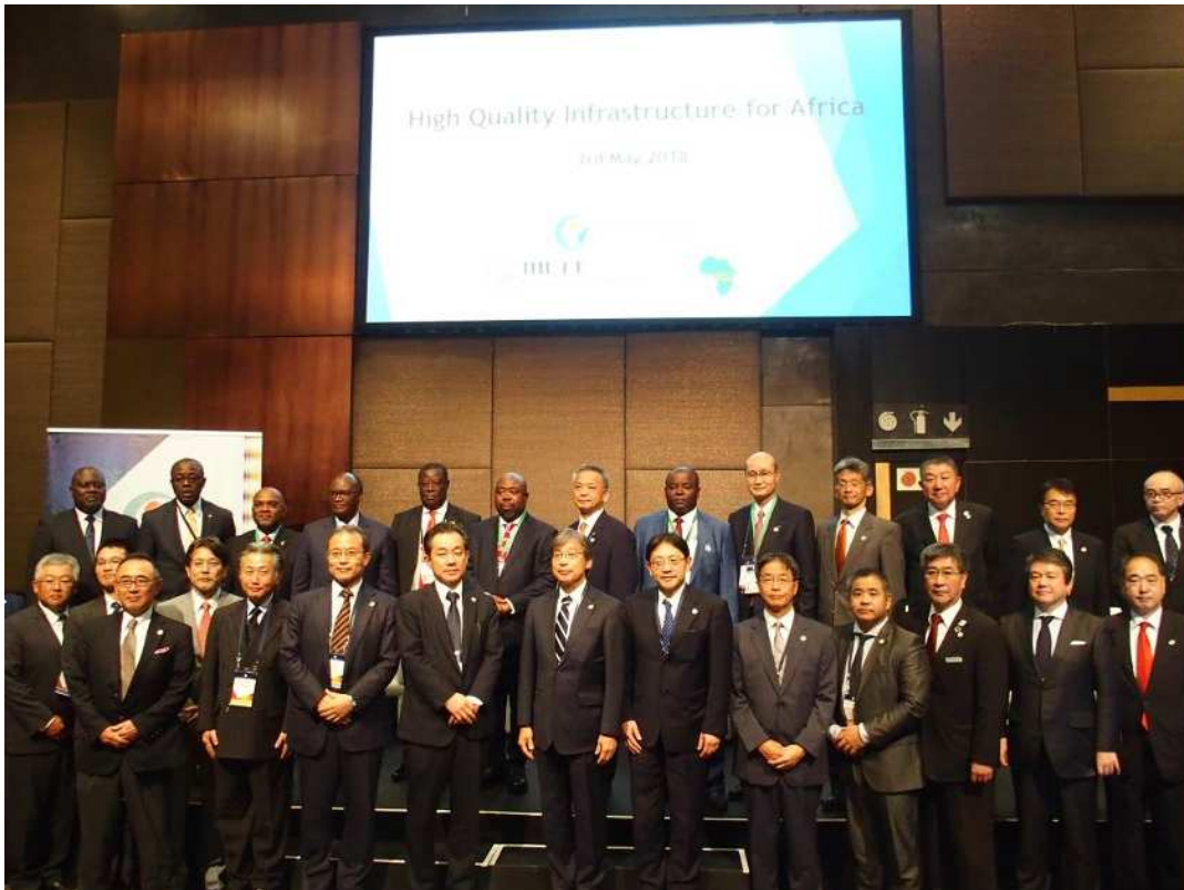
Side Event “High Quality Infrastructure for Africa” Conference