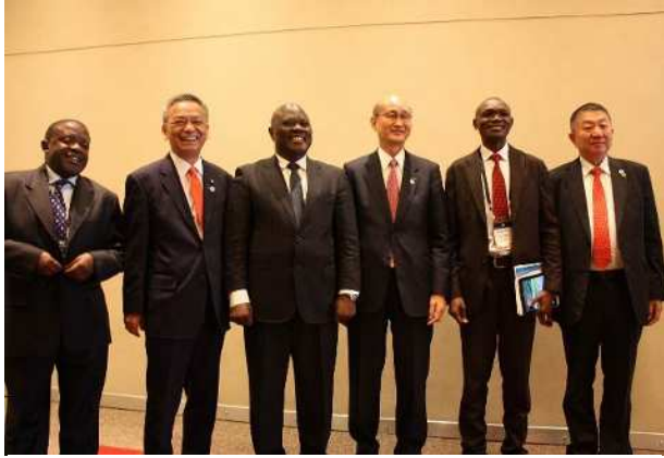
Meeting with Minister of State for Transport Bagiire