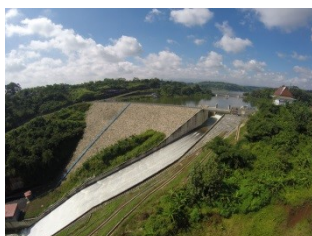
Integrated Water Resources and Flood Management Project for Semarang (Indonesia)