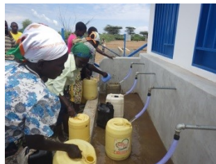
The Project for Rural Water Supply in Baringo Country (Kenya)