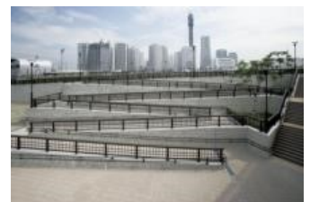
Minato mirai park