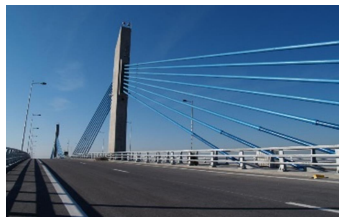
【 Tunisia 】 Rades-La Goulette Bridge Construction Project (2009)