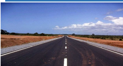
【 Ghana 】 Rehabilitation of Trunk Road. (2008)