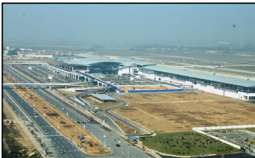
【 Vietnam 】 Noi Bai International Airport Terminal 2 (2014)