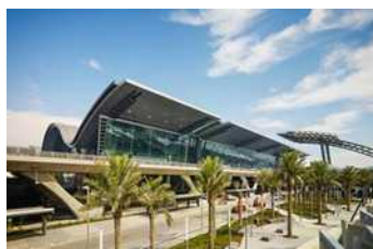
【 Qatar 】 New Doha (Hamad) International Airport, Passenger Terminal Complex (2014)