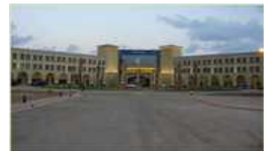
【 Djibouti 】 Kempinski Hotel and Resort Development Project (2008)