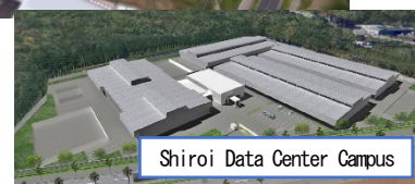
Shiroi Data Center Campus