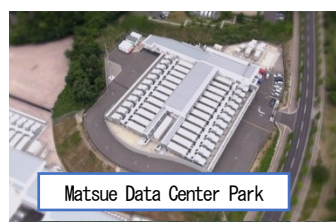
Matsue Data Center Park