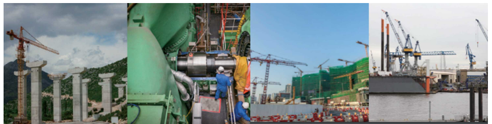
Illustration of Insurance Programs for infrastructure